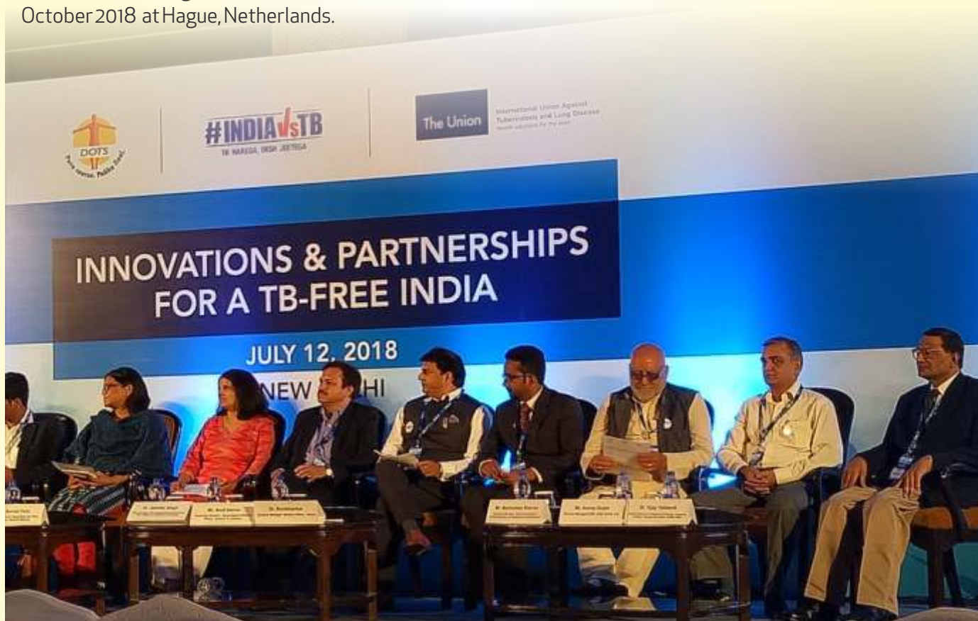
Pic: CGM (CSR), GAIL attending TB FREE INDIA summit, New Delhi