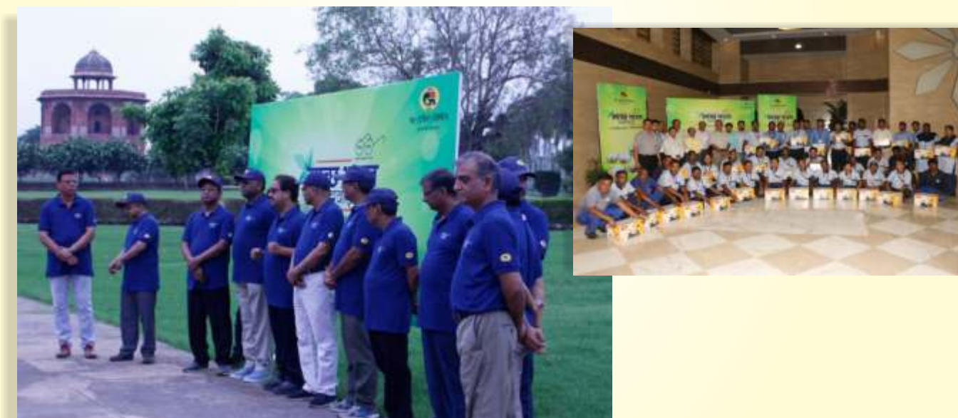
Pic: GAIL officials at Purana Qila observing Swachhta Pakhwada in New Delhi

During the Swachhta Pakhwada, various innovative activities aimed at creating maximum awareness on swachhta for achieving the objectives of Swachh Bharat Mission were carried out in GAIL. GAIL undertook various activities like awareness campaigns at its various offices, pledge taking, cleanliness drive in offices/unit premises, cleanliness drives in schools & townships, display of banners/posters and standees to generate awareness, tree plantation, walkathons, drawing competition, slogan competition, health talk, debate competition, distribution of water purifying shuddhu tablets, distribution of sanitary napkins, distribution of masks, gloves and other housekeeping material to safai sathis, health checkup camp & skit/play for public awareness etc. between 01.07.2018 to 15.07.2018.