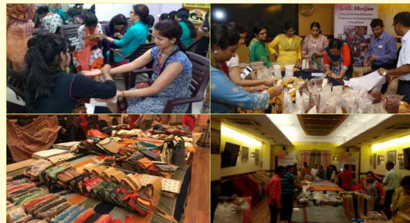
Pic: Glimpses of GAIL Asmita

generated from selling products made under project Shrijan was more than Rs. 1 lakh which has gone into the accounts of the federation of beneficiaries created under the project. Under project Taana-Baana as well, an amount of Rs. 25,000/- was generated which has also been transferred into the accounts of Self Help Group created under the project. Women beneficiaries from Asheray Welfare & Charitable Society also participated and applied Mehendi to women visitors to the exhibition.